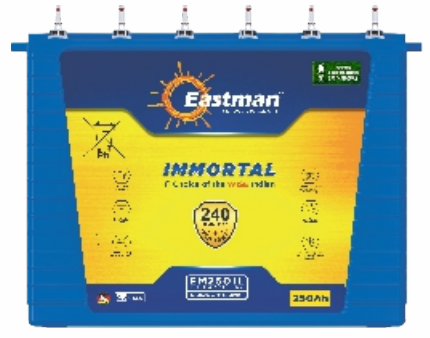
Available Capacity : 160Ah to 330Ah