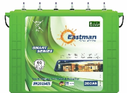
Available Capacity : 100Ah to 200Ah