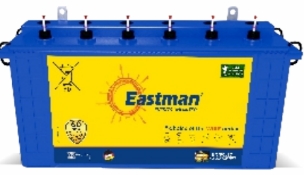
Available Capacity : 135Ah to 180Ah